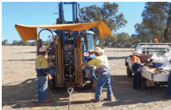
Exploration drilling at Felicitas in Toodyay

The exploration team will contact the landowner and/or occupier to schedule the drilling once the PoW has been approved. Drilling is by a tractor-mounted vacuum rig that drills 40 mm diameter holes to a maximum depth of 20 metres. Each drill hole is immediately plugged with a conical concrete plug to a minimum depth of 400 mm and backfilled with drill spoil. A small heap is left over the hole to allow for natural subsidence.